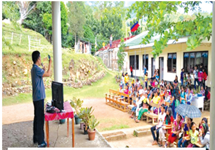
Aflatoun Orientation of students and parents of Sampinition High School, Manjuyod