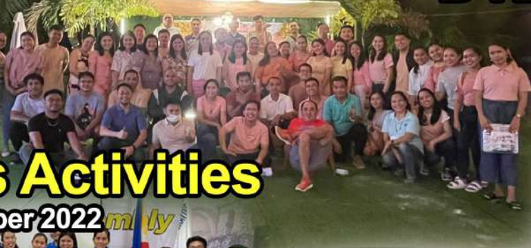
Activities November 2022