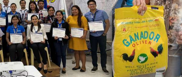
Staff Trainings November 2022