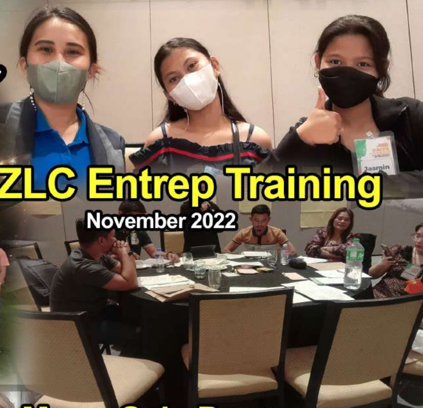
DYZLC Entrep Training November 2022