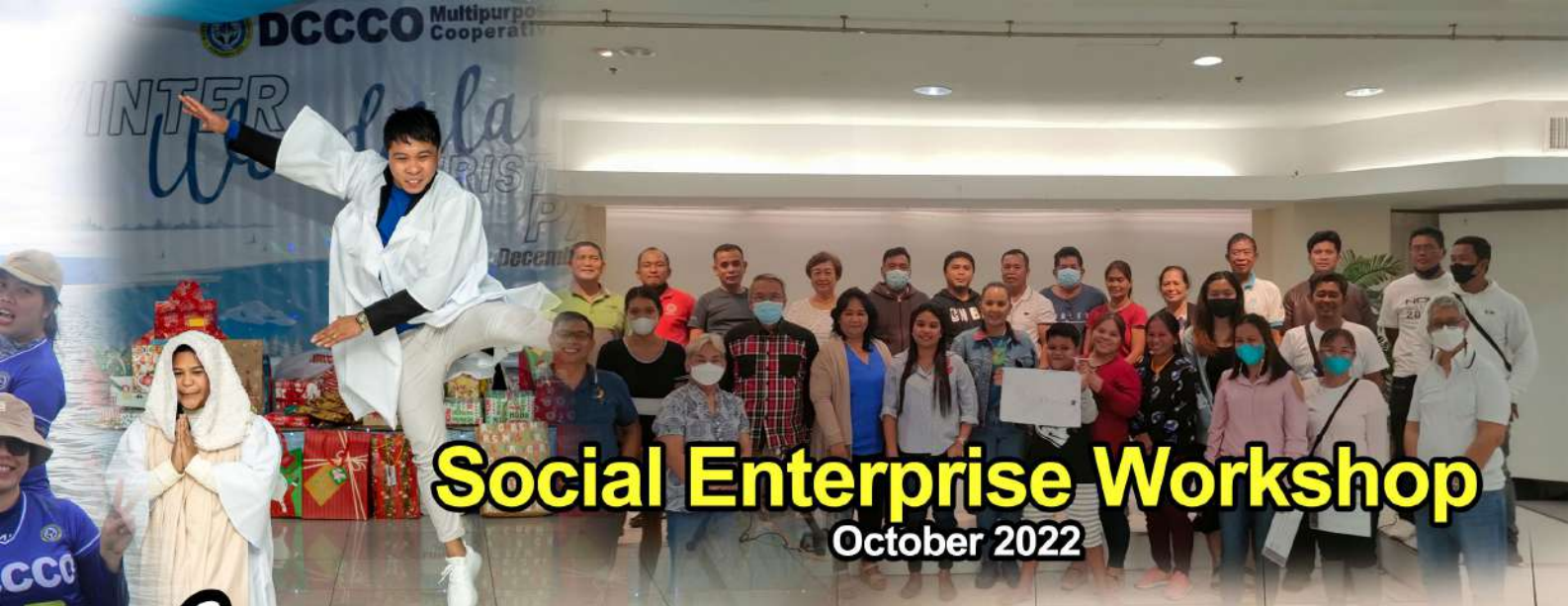
Social Enterprise Workshop October 2022